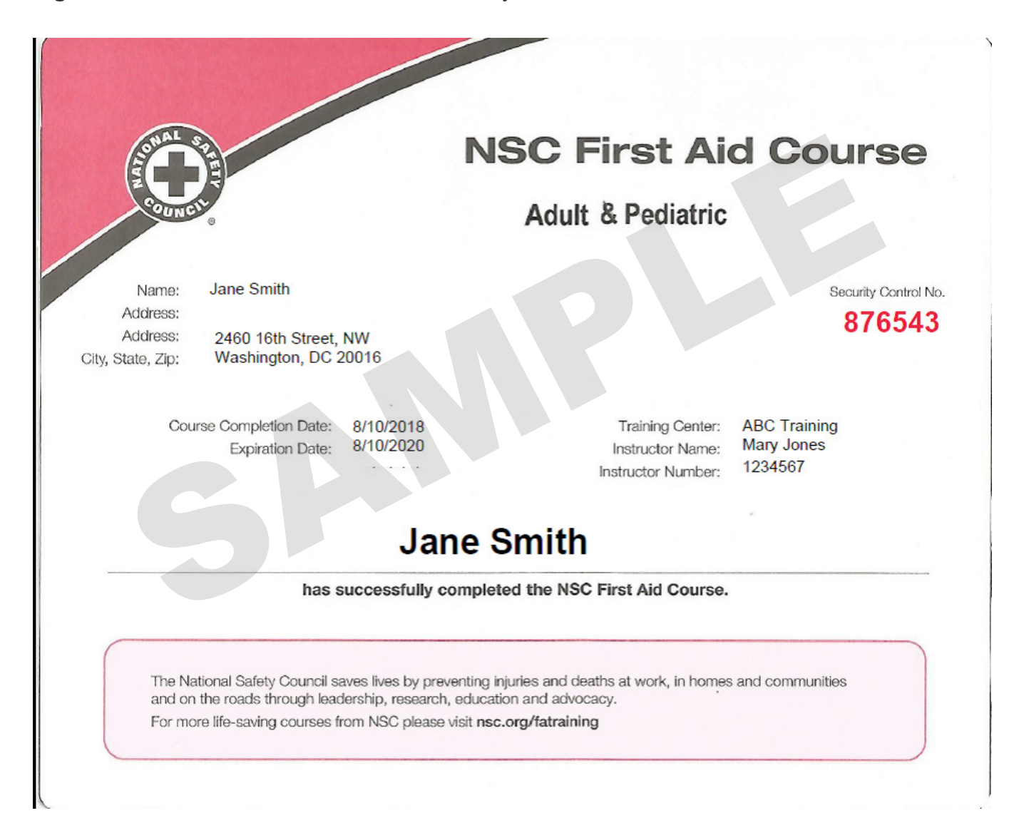
Figure 4. Certificate #1 documents First Aid only.